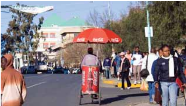
Maseru street scene