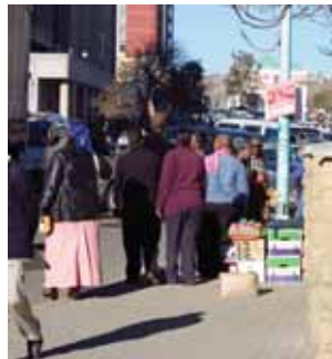
Busy Maseru street scene

The constitution provides for an independent judicial system. The judiciary is made up of the Court of Appeal, the