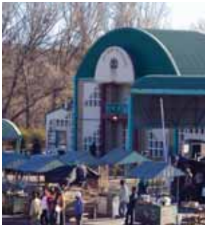
Maseru Border Post