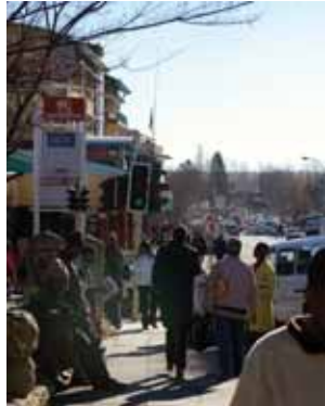
Maseru street scene

Should you be a prospective investor you can courier your passport to the LNDC and the LNDC will ensure that you get a multiple entry visa