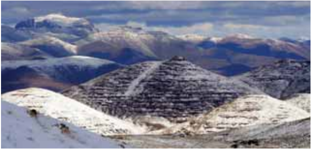
Snow capped mountains of Lesotho

Botswana, Namibia, South Africa, and Swaziland. With the exception of Botswana, these countries also form a common currency and exchange control area known as the Common Monetary Area (CMA). The loti is at par with the South African rand and the rand can be used interchangeably with the loti, the Lesotho currency (plural: Maloti). One hundred lisente equals one loti.