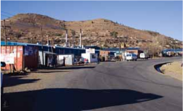
A business site