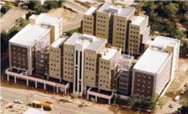
LNDC Building, Maseru