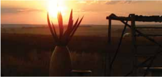
Setting sun over Lesotho

Finally, I wish to extend thanks to all those involved with the preparation of this guide which I am certain will be an important information provider in publicising Lesotho as an attractive destination for both foreign and domestic investment. We hope that you find this publication useful and we shall welcome any feedback on how you think we can improve and develop future editions to make them even more user-friendly.