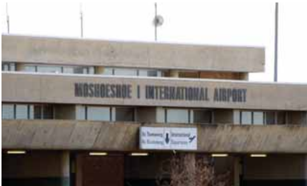
Moshoeshoe International Airport