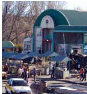
Maseru Border Post

Should you wish to visit Lesotho on a once-off basis.